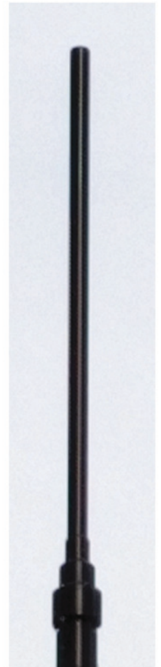
1710-2155 MHz Lower 9 dBi Gain